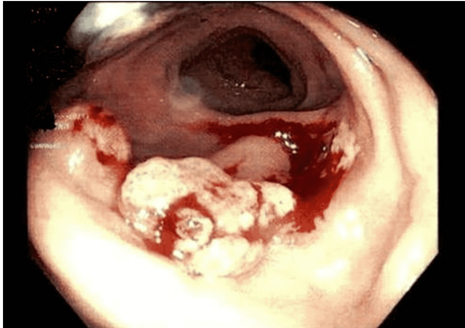
FIGURE 1: Colonoscopy showed a 20 mm polyp in the recto-sigmoid colon.