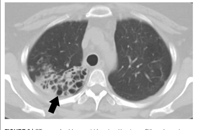
FIGURE 2 | CT scan of a 44-year-old female with primary Sjögren's syndrome demonstrating bronchiectasis on the right lower lobe.

cough, or isolated dyspnea. In rare occasions patients can also have hemoptysis likely due to exacerbation of bronchiectasis. Patients with bronchiectasis also had increased respiratory infections and pneumonia (80).