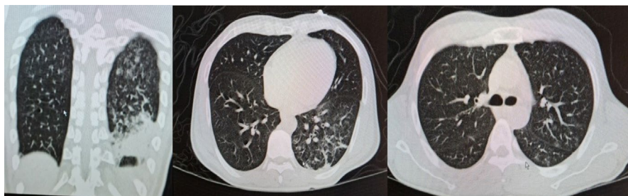
FIGURE 1 Lung HRCT: left lower lobe infiltration in favor of aspiration pneumonia

Acute encephalopathy has a wide range of possible causes, the most common of which are infectious. 6 To date, there have been no reports of encephalitis and seizures with the Iran's COVID-19 vaccine, but in a few cases, encephalopathy has been reported after injecting other types of COVID-19 vaccine. One of these cases has been reported in the article by Liu et al., in which two cases of encephalopathy were reported following the injection of the Moderna COVID-19 vaccine. Both patients were elderly and had no known neurological or psychological history, and their symptoms began approximately one week after the first dose of the Moderna COVID-19 vaccine. 12 But our