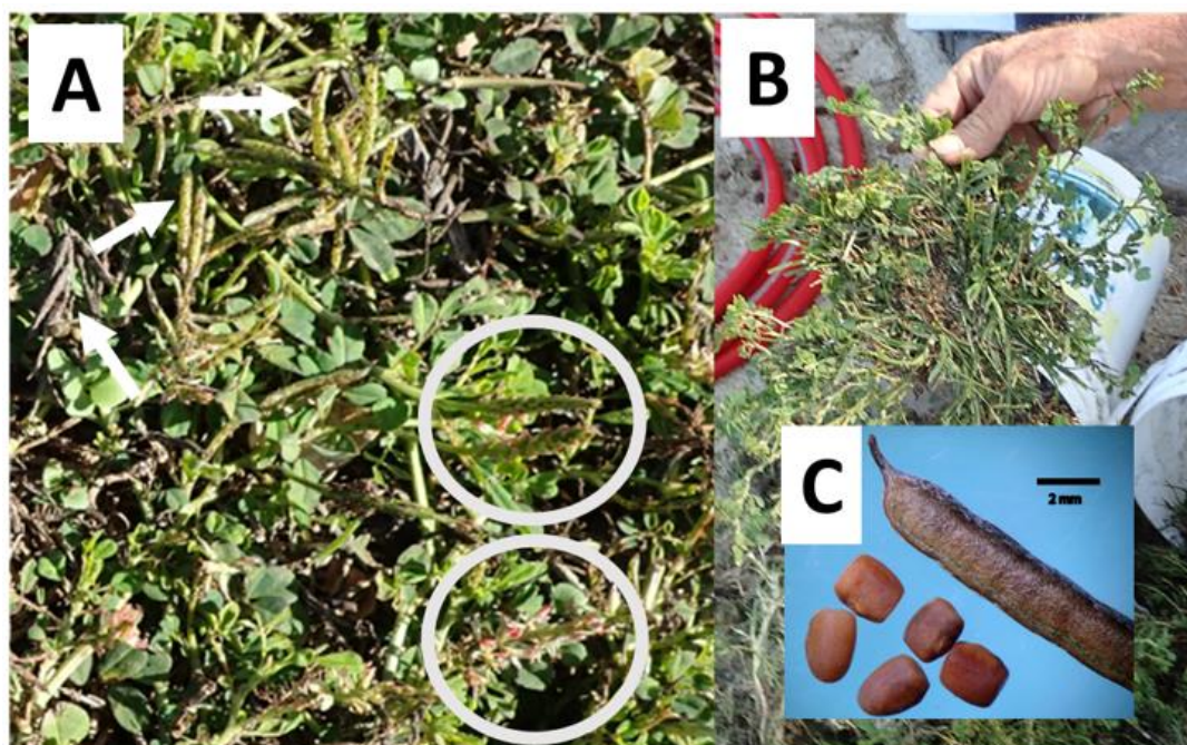
Figure 2. Creeping indigo on Oahu island, Waialua Polo Ranch: (A) the white circles enclose pink inflorescences arranged in elongated clusters ( \approx 10 cm long) with oblong dark green leaves typical of Fabaceae, with 5–11 leaflets per stem arranged in an alternating pattern (0.5–2.5 cm long). The white arrows point to clusters of bright green immature and dry narrow straight cylindrical pods ( \approx 2.5 cm long); (B) uprooted creeping plant; (C) typical hairy stiff dry pod with pointed hooked tip, contains 4–8 light brown quadrangular \leq 2 mm-long seeds (bar = 2 mm).