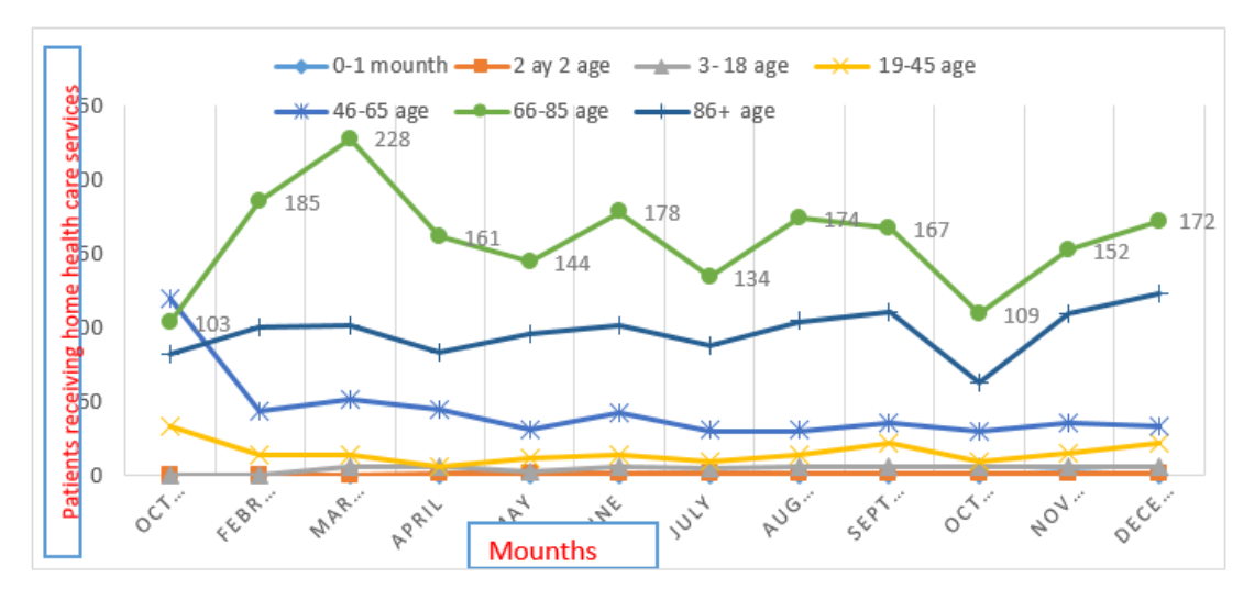
Fig. 2: Distribution of Patients Receiving Home Health Services by Age

als aged 86, and over who receive home health care services is 30.2% (Fig. 2).