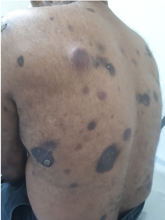
Figure 1 – Patient with tumoral and hyperchromatic cutaneous lesions, some with necrosis central and secretion.