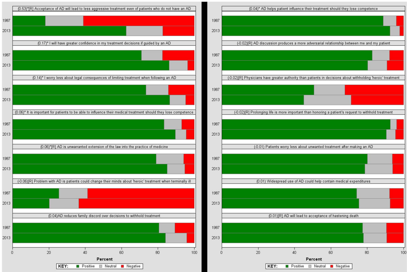
Figure 1. Comparison of the 1989 cohort to the 2013 cohort of doctors on each of the 14 statements about Advance Directives. Please note that ( ) indicates the Success Rate Difference Effect Size (−1.0 to +1.0). [R] indicates statements that oppose Advanced Directives. An asterisk sign* indicates the Mann-Whitney Wilcoxon test with the Bonferroni adjustment is significant at \alpha = 0.05/14 . doi:10.1371/journal.pone.0098246.g001

years age group (25 th percentile = 0.32, 75 th percentile = 0.57), p = 0.0314 , and SRD = 0.078 .