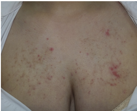
Fig 5. PP: clinical presentation of patient 4. Scattered erythematous papules on a background of hyperpigmented reticulated patches on the chest.

Ketosis has frequently been linked to PP development in various reports. 2,3,10 One of the earliest to note correlation was Teraki et al. 7 They reported 10 cases, of which, 8 were found to have ketosis by laboratory findings precipitated by either dieting, loss of appetite, or insulin-dependent diabetes mellitus. 7 Other conditions that have been reported to lead to ketosis included obesity, 11 bariatric surgery, 12 and hyperemesis gravidarum of pregnancy. 5 It is important to consider PP, as its initial presentation may not be a straightforward diagnosis. For instance, a report of a patient that was initially thought to have an urticarial eruption later had PP diagnosed, caused by ketosis secondary to anorexia nervosa. 13 Previous reports have also supported the association between anorexia nervosa and PP. 8 There are frequent reports of ketosis secondary to diabetes mellitus. 6 Similarly, and of interest to our case, diet is also linked to the development of PP caused by ketosis. 2,7,8,14,15 In a recent report by Almaani et al, 15 PP development in 2 of 3 Jordanian patients was linked to fasting during the month of Ramadan, whereas the other case was a