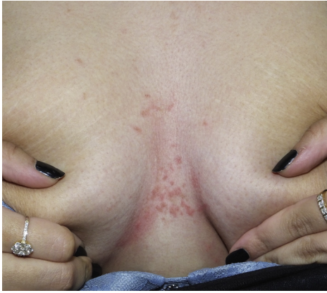
Fig 4. PP: clinical presentation of patient 3. Blanching erythematous papules involving the intermammary area.