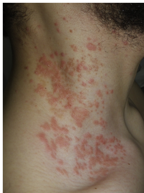
Fig 3. PP: clinical presentation of patient 2. Erythematous papules and plaques on the neck.

on the clinical presentation that was reinforced with the patient's response to treatment.