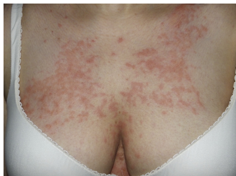
Fig 1. PP: clinical presentation of patient 1. Reticulated erythematous papules and plaques on the chest.