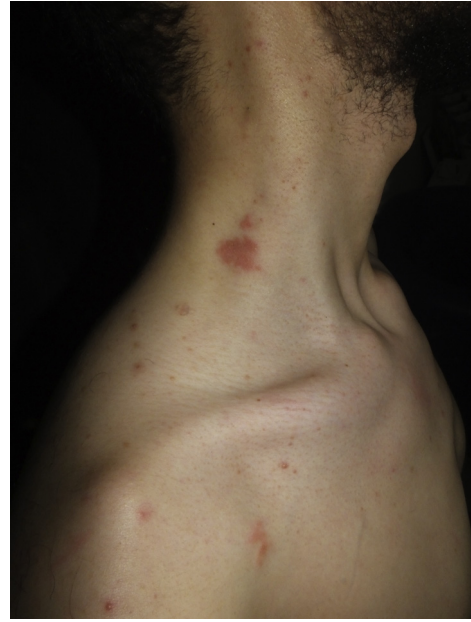
Fig 6. PP: recurrence of PP after resuming ketogenic diet in patient 2. Few erythematous plaques with scattered red papules on the side of the neck and upper chest. These lesions have recurred after resuming ketogenic diet after a period of clearance from the previous eruption.

Ketosis has frequently been linked to PP development in various reports. 2,3,10 One of the earliest to note correlation was Teraki et al. 7 They reported 10 cases, of which, 8 were found to have ketosis by laboratory findings precipitated by either dieting, loss of appetite, or insulin-dependent diabetes mellitus. 7 Other conditions that have been reported to lead to ketosis included obesity, 11 bariatric surgery, 12 and hyperemesis gravidarum of pregnancy. 5 It is important to consider PP, as its initial presentation may not be a straightforward diagnosis. For instance, a report of a patient that was initially thought to have an urticarial eruption later had PP diagnosed, caused by ketosis secondary to anorexia nervosa. 13 Previous reports have also supported the association between anorexia nervosa and PP. 8 There are frequent reports of ketosis secondary to diabetes mellitus. 6 Similarly, and of interest to our case, diet is also linked to the development of PP caused by ketosis. 2,7,8,14,15 In a recent report by Almaani et al, 15 PP development in 2 of 3 Jordanian patients was linked to fasting during the month of Ramadan, whereas the other case was a