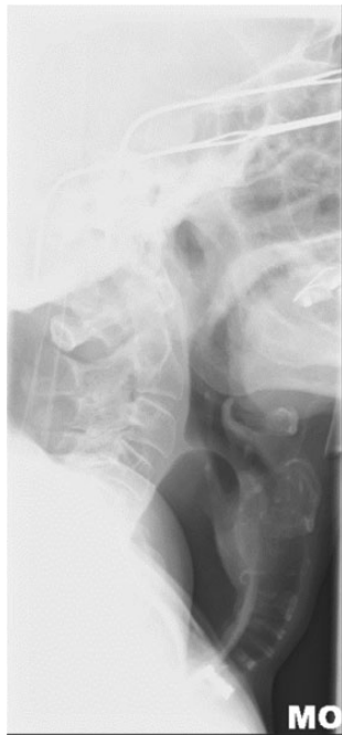
Figure 1: Lateral neck X-ray showing dilated oesophagus displacing trachea anteriorly.