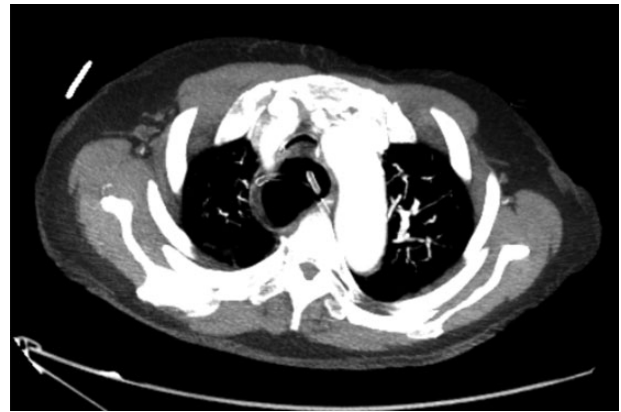
Figure 3: Axial slice of CT chest after nasogastric decompression showing persistent megaesophagus and airway narrowing.

Over 50 years ago, the first instance of achalasia presenting in such fashion was first described [1], and since then, it has been sporadically reported in the literature. These cases have often had similar presentations, typically an elderly woman presenting with sudden onset of respiratory distress, stridor after a meal;