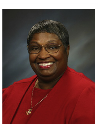
Figure 3. Dr. Alexa Canady. (Used with permission from Shaw G. Black History Month Honors Alexa Canady, MD: First African-American Woman Neurosurgeon. Available at: https://medicine.iu.edu/blogs/ women-in-medicine/black-history-monthhonors-alexa-canady-md-first-africanamerican-woman-neurosurgeon#: ~:text=All%20Articles-,Black%20History %20Month%20Honors%20Alexa% 20Canady%2C%20MD,First%20African% 2DAmerican%20Woman% 20Neurosurgeon&text=Alexa%20Irene% 20Canady%2C%20MD%2C%20was,the% 20United%20States%20in%201981. Accessed July 20, 2020.15)

and many more. Perhaps the great success of these individuals is a reflection of the