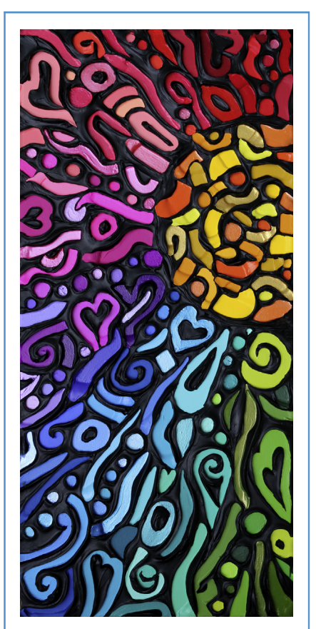
Figure 7. Heart of Barcelona, by Jeff Hanson. © 2020 All Rights Reserved Jeffrey Owen Hanson LLC.

productive engagement for individuals and corporations alike.<sup>57</sup>