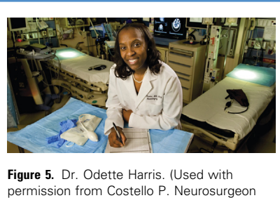
permission from Costello P. Neurosurgeon Odette Harris: A unique and rare physician. Available at: https://scopeblog.stanford.edu/ 2018/06/20/neurosurgeon-odette-harris-aunique-and-rare-physician/ #: ~:text=Jamaican%2Dborn%20Odette% 20Harris%20was.journey%20in%20a% 20new%20podcast.&text=The% 20numbers%20speak%20for% 20themselves,with%20an%20abundance %20of%20women. Accessed July 20, 2020.<sup>17</sup>)

resilience, strength, and adaptability that they have built through their lived experiences as immigrants.