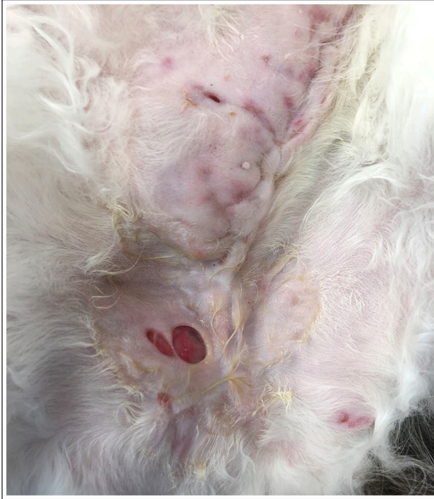
Figure 2 The cat first presented to the dermatology service with multiple erythematous-to-purpuric macules and ulcerations forming cavernous and communicating draining tracts on the ventral abdomen. A firm, irregularly shaped subcutaneous mass was present along the previous incision site and extended to the right

They extended into the musculature and contained very small amounts of serous exudate. An approximately 6×6 cm, palpable, firm, irregularly shaped subcutaneous mass was present along, and to the right of, the previous incision site. Physical examination was otherwise unremarkable.