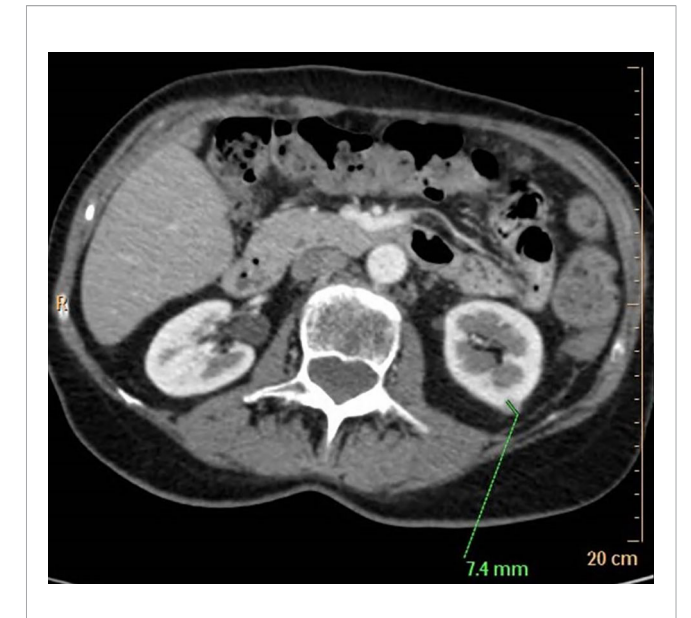
FIGURE 3 | 7.4 mm metastasis in the left renal cortex. Contrast-enhanced computed tomographic scan.

Mitotane plasma levels were monitored by the Lysosafe service (www.lysosafe.com). Therapeutic mitotane concentration was achieved within two months. Mitotane, with a maintenance dose between 2.0 and 2.5 grams/day, was well tolerated during the whole course of its administration. The patient was substituted with hydrocortisone, 30 mg/day. She was educated for signs and symptoms of adrenal failure and supplied with an emergency card and parenteral hydrocortisone KIT.