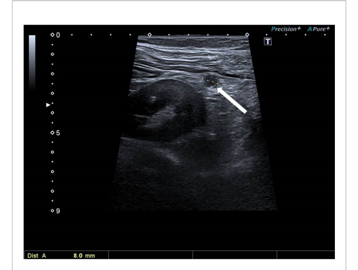
FIGURE 2 | 8 mm metastasis within the left perirenal fat. Ultrasonographic image.

2,5 months following adrenalectomy, the tumour bed was irradiated using a Varian Clinac iX 6 MV photon beam instrument with a total dose of 50.5 Gy. The postoperative 3- and 6-month re-staging CT did not show any tumour lesion. Nine months after the initial diagnosis, abdominal ultrasonography and re-staging CT revealed multiple peritoneal nodules raising the suspicion of peritoneal carcinomatosis, a periventricular lymph node, and a left kidney metastasis ( Figures 2 and 3 ). The maximal tumoral diameter was 12 mm. Laparoscopic tissue sampling from the ascending colon and sigmoid intestine resulted in the histological diagnosis of peritoneal carcinomatosis from ACC. Therefore, twelve months following adrenalectomy, mitotane monotherapy was started according to a high-dose regimen (13).