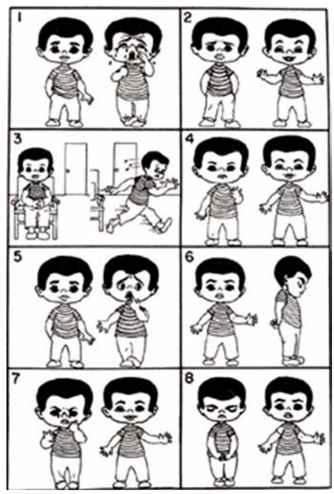
Fig. 4: Venham's picture scale

Pain control is an indispensable part of modern dentistry. Prevention of pain during dental procedures can nurture relationship of the patient and dentist, building trust, allaying fear and anxiety, thus promoting a positive dental attitude. Pain control measure, such as administration of LA, the most