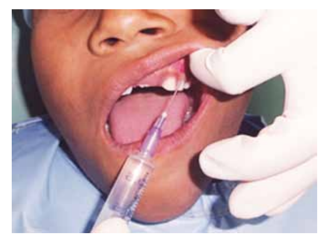
Fig. 1: Local anesthesia administration using conventional syringe