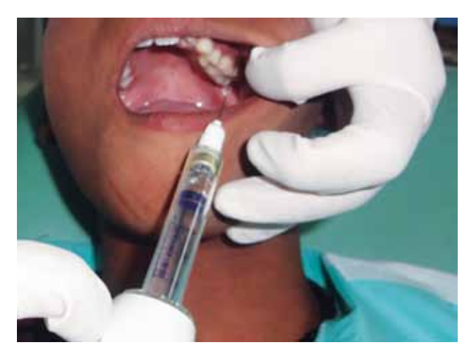
Fig. 3: Local anesthesia administration using comfort control syringe

Since, it is a combination procedure, LA was then administered using conventional syringe as described in group I. After LA administraion by TENS system and conventional syringe method, again the response of the child was noted using the above-mentioned criteria, including pain score, which was evaluated using Wong-Baker's scale.<sup>2</sup>