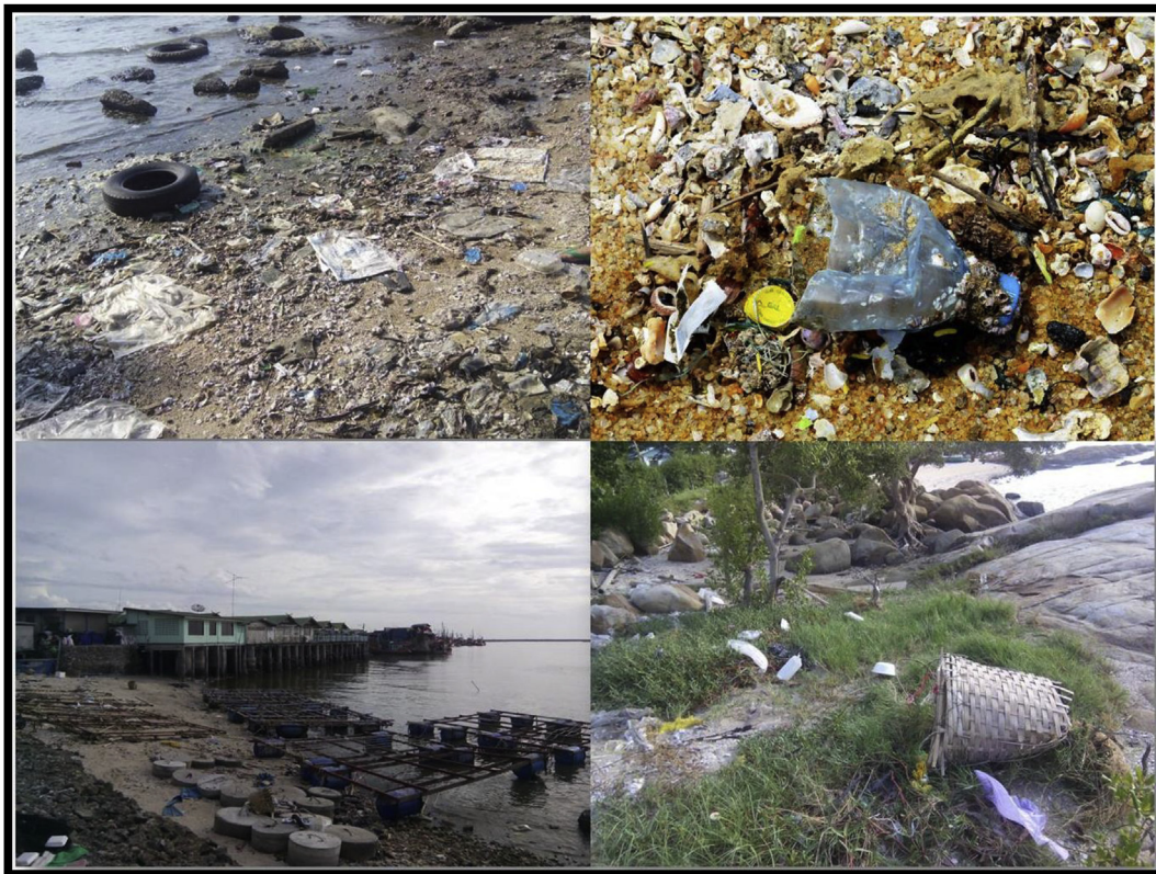
Figure 4. Negative effects of plastic pollution on coastal and marine vicinity (photo authorship: J.D.M. Senevirathna).

the effect of ghost fishing in Puget Sound, USA (Gilardi et al., 2010), and accordingly, the cost for commercial crab fishery by ghost fishing is nearly US$ 19,656. In Indonesia, severe changes on fishing grounds were recorded by litter accumulation, and fishing gear types were identified as the main component of marine litter. Further, debris accumulation caused negative impacts on the artisanal fishery sector in Indonesia (Nash, 1992). As per UNEP (2009), an annual loss of US$ 250 million was due to the loss of the lobster fishery sector by the presence of ghost fishing gears.