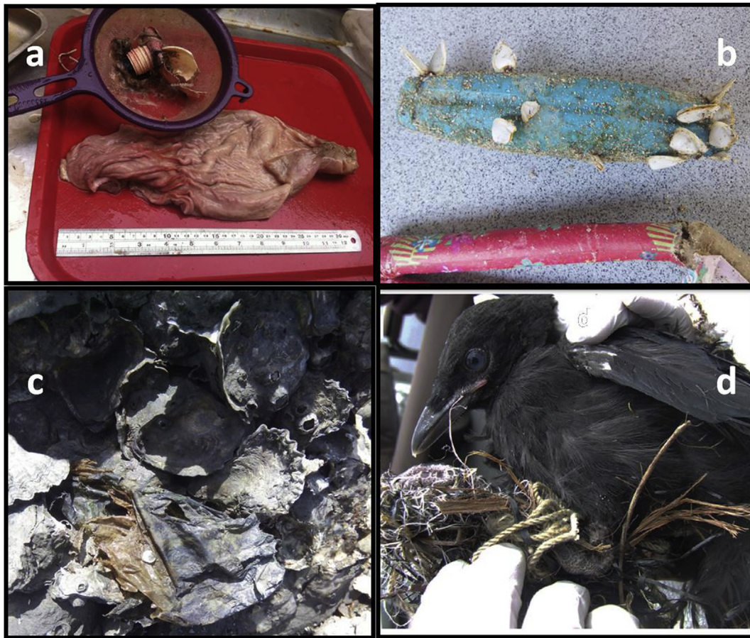
Figure 2. Effects of Plastics on coastal and marine biota: a) Plastics ingestion by a blueshark: Priona ceglauca of Carlos Canales-Cerro (Thiel et al., 2018; photo authorship: Dr. Carlos Canales-Cerro), b) Attachment on plastic debris by Goose Barnacle, Lepas anserifera (photo authorship: J.D.M. Senevirathna), c) Partial cover of macroplastic pollutants on Rock Oyster: Saccostrea forskalii colony (photo authorship: J.D.M. Senevirathna), d) Entanglement of nestling in a synthetic plastic string (photo authorship: Townsend and Barker, 2014).

the effect of debris from fishing hooks, and the line increased by 84% with negative impacts on poriferans and coelenterates, causing sub-lethal and lethal consequences.