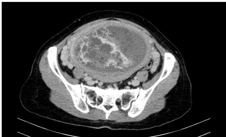
FIGURE 1: Contrast-enhanced CT appearance of the hydatidiform mole

The patient was managed by a multidisciplinary team involving an endocrinologist, obstetrician, internist, and anesthesiologist. Given the urgency for surgical intervention, she was admitted to the intensive care unit and commenced on propylthiouracil (PTU) 150 mg PO every eight hours, intravenous propranolol 40 mg every eight hours and intravenous 8 mg/daily of dexamethasone. Five drops of Lugol's iodine were added for further and faster control of her hyperthyroid state. Subsequently, a contrast abdomen CT scan confirmed the existence of a uterine mass measuring 15.6 cm \times 16.3 cm \times 8.2 cm, compatible with the diagnosis of gestational trophoblastic disease (Figure 1).