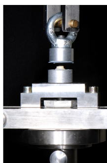
Figure 1. Design of retention strength measurement.