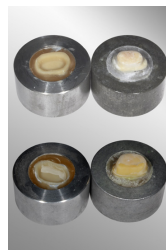
Figure 2. Observed failure types: resin composite cement remaining on dentin (pictured above) and mixed failure type (pictured below) with resin composite cement on dentine and concurrent on CAD/CAM polymer crown.

For each separate resin composite cement group, the estimated cumulative failure function of the debonded crown given the retention strength is presented in Figures 3 and 4. These estimates are adjusted for censoring (Table 4). Within the RelyX Ultimate groups, no significant differences were determined according to the Breslow–Gehan test ( p > 0.083 ) (Figure 3). In contrast, significant differences were found between the Variolink II groups ( p = 0.016 ) (Figure 4). The lowest retention strength in comparison with the remaining groups occurred for the Monobond Plus/Heliobond group. The median retention strength for Monobond Plus/Heliobond (0.004 MPa) was the lowest and statistically different from crowns pretreated with visio.link (0.69 MPa), pretreated with Margin Bond mixed with acetone (0.62 MPa) and crowns without pretreatment (0.52 MPa). Pretreatment with Monobond Plus/Heliobond resulted in the poorest survival because the estimated cumulative function of the debonded crown increased very quickly with increasing retention strength.