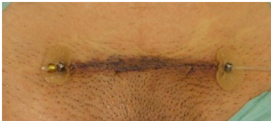
Figure 2. Interstitial brachytherapy for the treatment of a suprapubic keloid scar: the catheter, is placed within the dermis at the time of the extralesional scar excision.