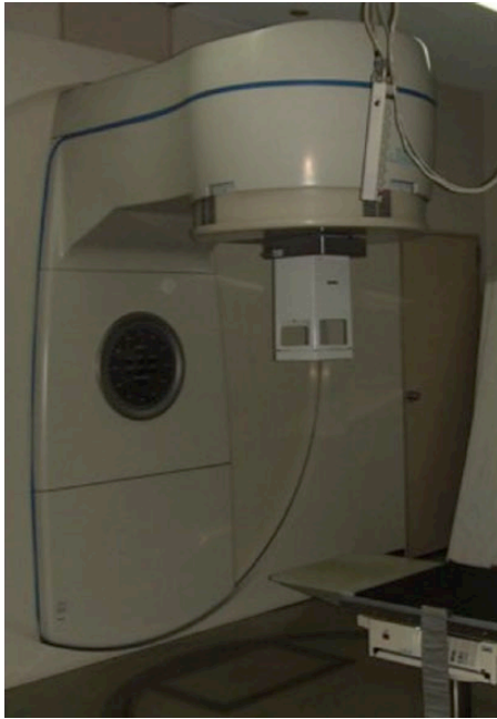
Figure 1. External beam radiotherapy machine.