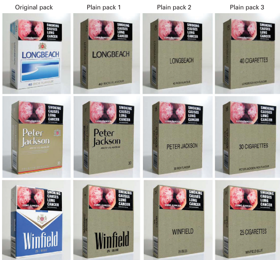
Figure 1 Original and plain packs for each brand.

perceived sensory attributes. 29, 30 In the current study, respondents were asked to rate the cigarette pack they were shown in relation to: brand image (the mental associations that are stimulated by the pack's appearance alone); smoker attributions (anticipated personality/character type of the typical person who might be expected to regularly smoke the pack displayed); and inferred smoking experience (the type of smoking experience which might be anticipated from a cigarette contained in the displayed pack).