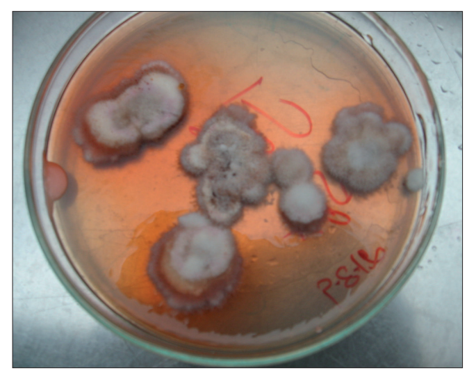
Figure 3: Fusarium colony on SDA after 5 days of incubation

culture. Later, another tissue sample was sent for repeat isolation of the fungus to confirm the pathogenic role of the fungus. This time also the same fungus i.e. Fusarium was isolated. Meanwhile, histopathological examination of the tissue revealed the dense infiltration of the tissue with neutrophils, lymphocytes and septate fungal hyphae with fusiform fungal spores.