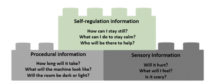
FIGURE 2 Constructing an understanding of a planned procedure [Colour figure can be viewed at wileyonlinelibrary.com]