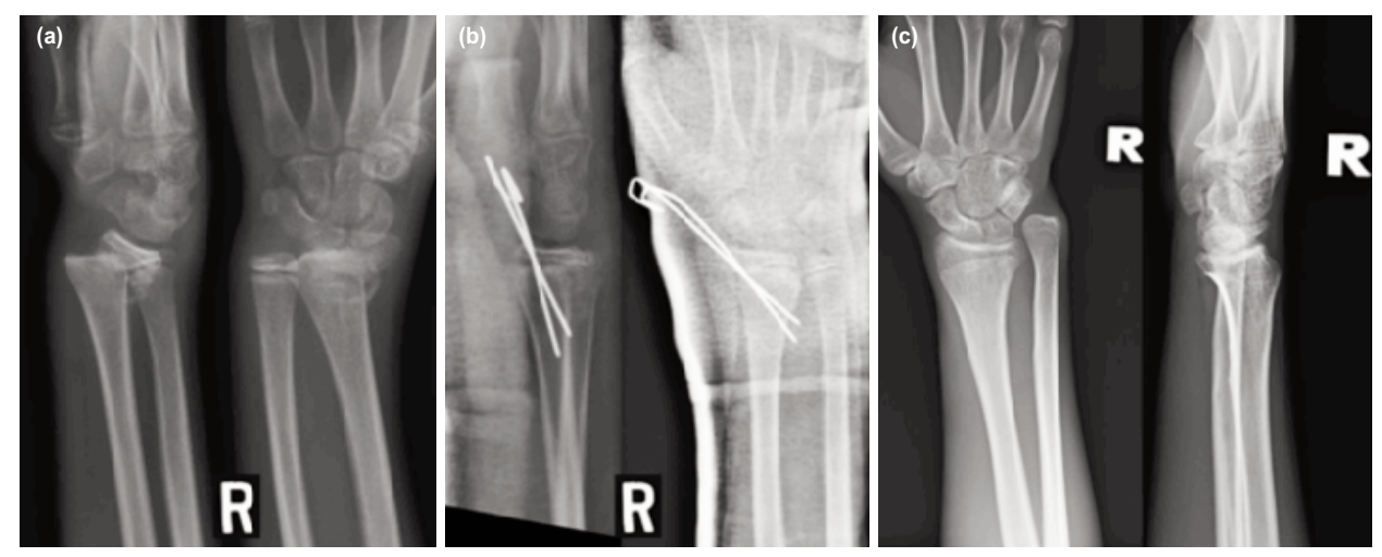
Fig. 4: Photo showing (a) the initial fracture of the distal radial physis with dorsal displacement and angulation in one of the children in this study who was a 12-year-old boy, (b) the physeal fracture was successfully reduced both on AP and lateral views, and was immediately fixed with two smooth K wires to maintain the reduction, and (c) at skeletal maturity, the physeal arrest of the distal radius was observed on plain radiographs manifested by reduction in radial height compared to the ulna on AP view and loss of normal metaphyseal contour of the distal radius subarticularly on lateral view. The metaphysis immediately under the wrist joint appeared short and deformed on lateral radiograph. Despite this, the child had good overall result at skeletal maturity.

continues to occur as long as the physis is still open. Any injury near or at growth plate requires a final assessment at or after skeletal maturity age, particularly in those who have a fracture near to skeletal maturity age in which the remodelling capacity becomes less predictable<sup>28</sup>. To our knowledge, there are only a few reports in the medical literature on the long-term functional and radiological outcomes of fractures at, or after, skeletal maturity, particularly comparing between the usage of the cast alone and the cast with a wire fixation in these fractures<sup>16,22-24</sup>.