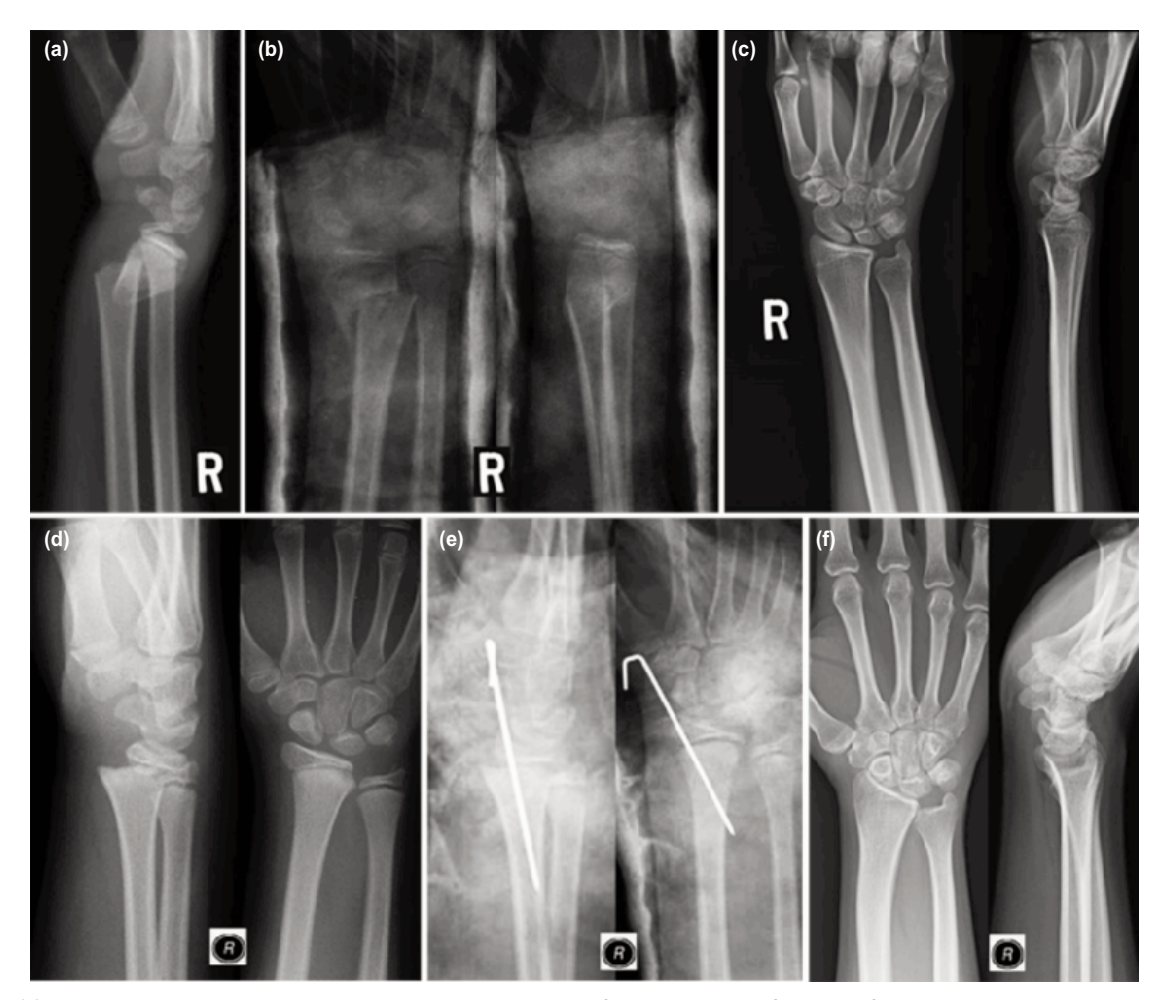
Fig. 3: (a) Photos showing the pre-reduction lateral radiograph of a metaphyseal fracture of the distal right radius with dorsal angulation about 45° in a 13-year-old boy, (b) immediate reduction of the fracture followed by a cast application improved the dorsal angulation on lateral radiograph and showed good bone contact on AP view, (c) good remodeling and bone union as seen at skeletal maturity, (d) distal physeal fracture of the right radius on a different child who was a 12-year-old boy with dorsal translation and dorsal tilt of the epiphysis, (e) closed reduction and percutaneous smooth K wire corrected the displacement and secured the reduction, (f) and finally AP and lateral radiographs at skeletal maturity revealed complete healing of the fracture without evidence of physeal arrest.