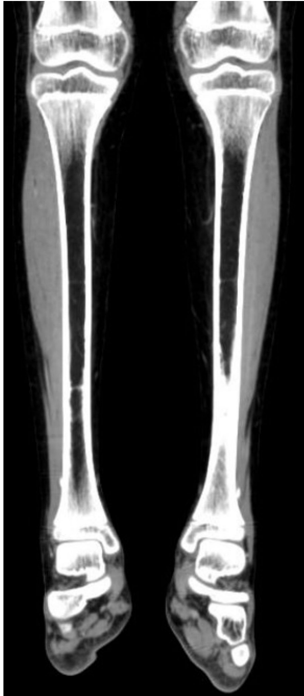
FIGURE 1: CT lower limb prior to fibula flap harvest, showing normal subtalar joint angulation.

The planned procedures were performed with no complications (Figure 2).