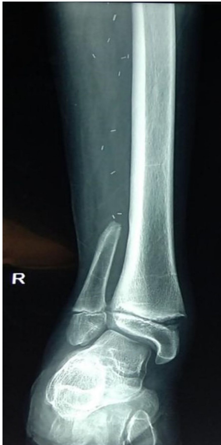
FIGURE 3: Anteroposterior radiograph of right ankle joint after fibula flap harvest, showing increased subtalar joint angulation.

The range of movement in the right ankle was full and free. MRI of the right subtalar joint done in May 2019 revealed an ankle valgus deformity of the subtalar joint (Figure 4) with characteristic features: (1) mild joint effusion in the ankle and subtalar region; (2) marrow edema involving the parapyseal regions of the distal tibia and lateral malleolus; (3) irregularity with marrow edema of the metaphyseal end of the distal tibial epiphyseal plate (reactive changes due to the valgus deformity); and (4) a tear of the anterior talofibular ligament.