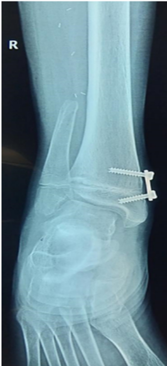
FIGURE 5: Anteroposterior radiograph of right ankle joint eight months after plating for growth modulation.