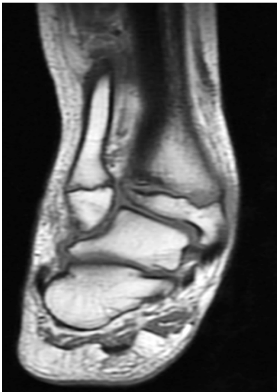
FIGURE 4: MRI of right ankle joint (coronal section) showing ankle valgus deformity.

The patient underwent growth modulation surgery of the right ankle in June 2019 (Figure 5). Knee, ankle, and toe mobilization exercises were started postoperatively.