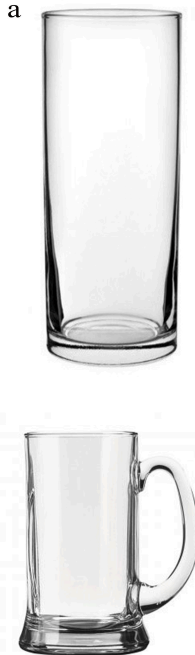
Fig. 2. Straight-sided glassware used during the intervention condition: highball pint and half-pint glasses (left) and/or pint and half-pint tankards (right). Both types of glassware had parallel sides.

Venues were provided with enough straight-sided glasses to replace their usual glasses, and this could consist of highball glasses only,