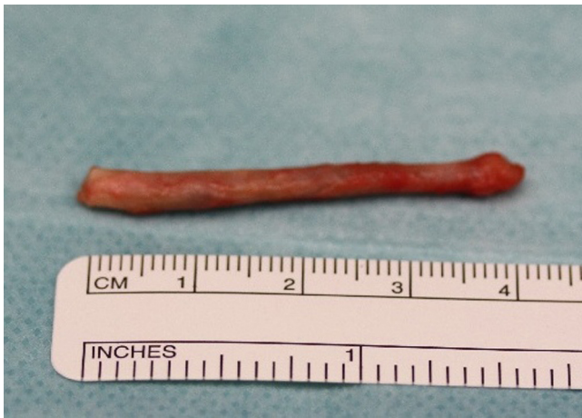
Fig. 3. Biopsied 4 cm piece of styloid process.

Two months after being discharged from our hospital, the patient again presented himself to our department with occurrence of vertigo, which improved without treatment after two days. To date, the patient feels relief, continues living a normal life, and no longer takes tilidine medication; instead he uses a low daily dose of gabapentine, which has been administered by a medical psychotherapist as prophylaxis for neuropathic pain in the head and neck area. No elevated occurrence of vertigo was noticed, and he stated two years after surgery that his quality of life has improved.