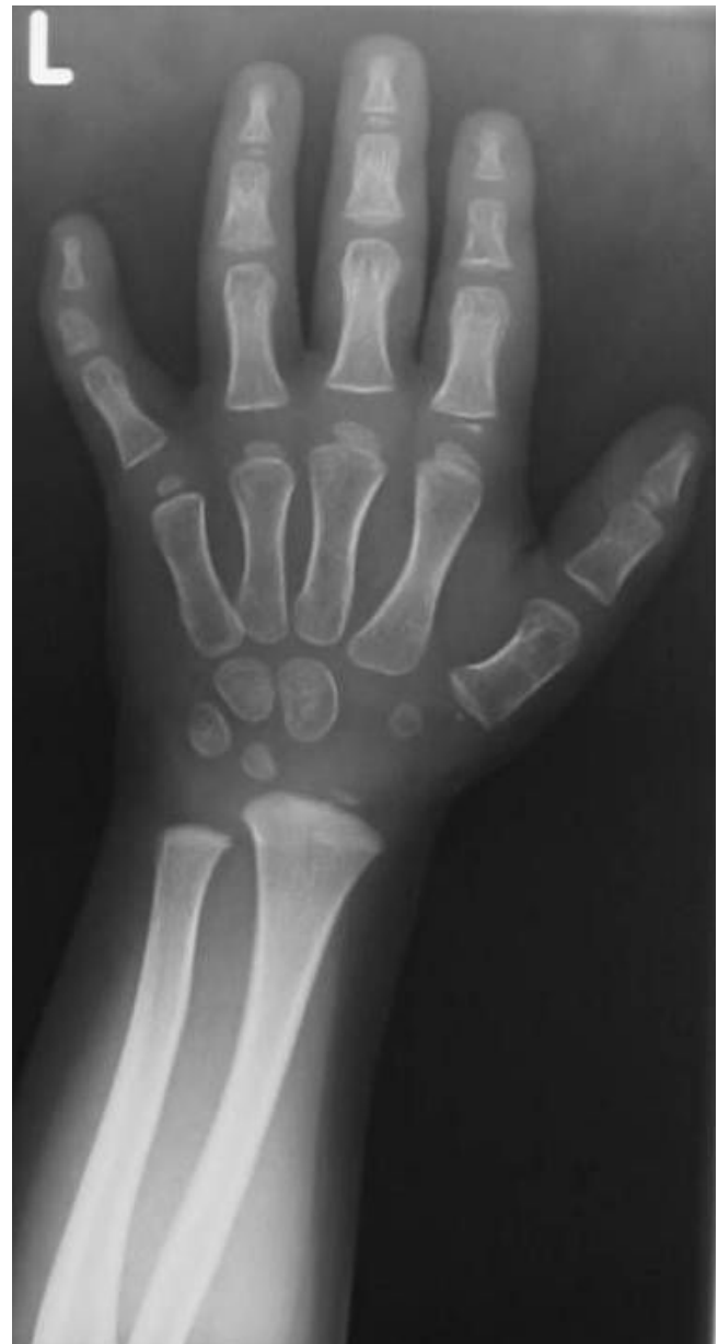
Figure 1 Anteroposterior hand radiograph at the age of 2- years showed advanced carpal ossification centres equivalent to bone age of 4 years 8 months, supernumerary ossicles at the proximal portion of the first metacarpal and another at the proximal portion of the middle phalanx of the second metacarpal. Delta like- middle phalanx of the fifth finger was evident.

nations were normal, as were blood biochemistry and screening for mucopolysaccharoidosis were normal.