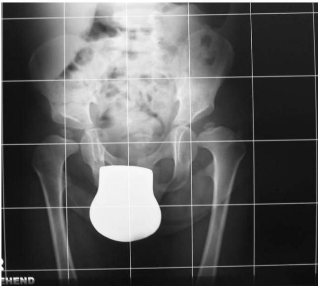
Figure 2 Anteroposterior radiograph of the pelvis showed a mild monkey wrench appearance of the femora, elevated greater trochanters, coxa vara, rounded shaped dysplastic capital femoral epiphyses and a horizontally dysplastic acetabulae and a tongue-like projection of the lesser trochanters.

results. No specific molecular investigations have been done for this patient.