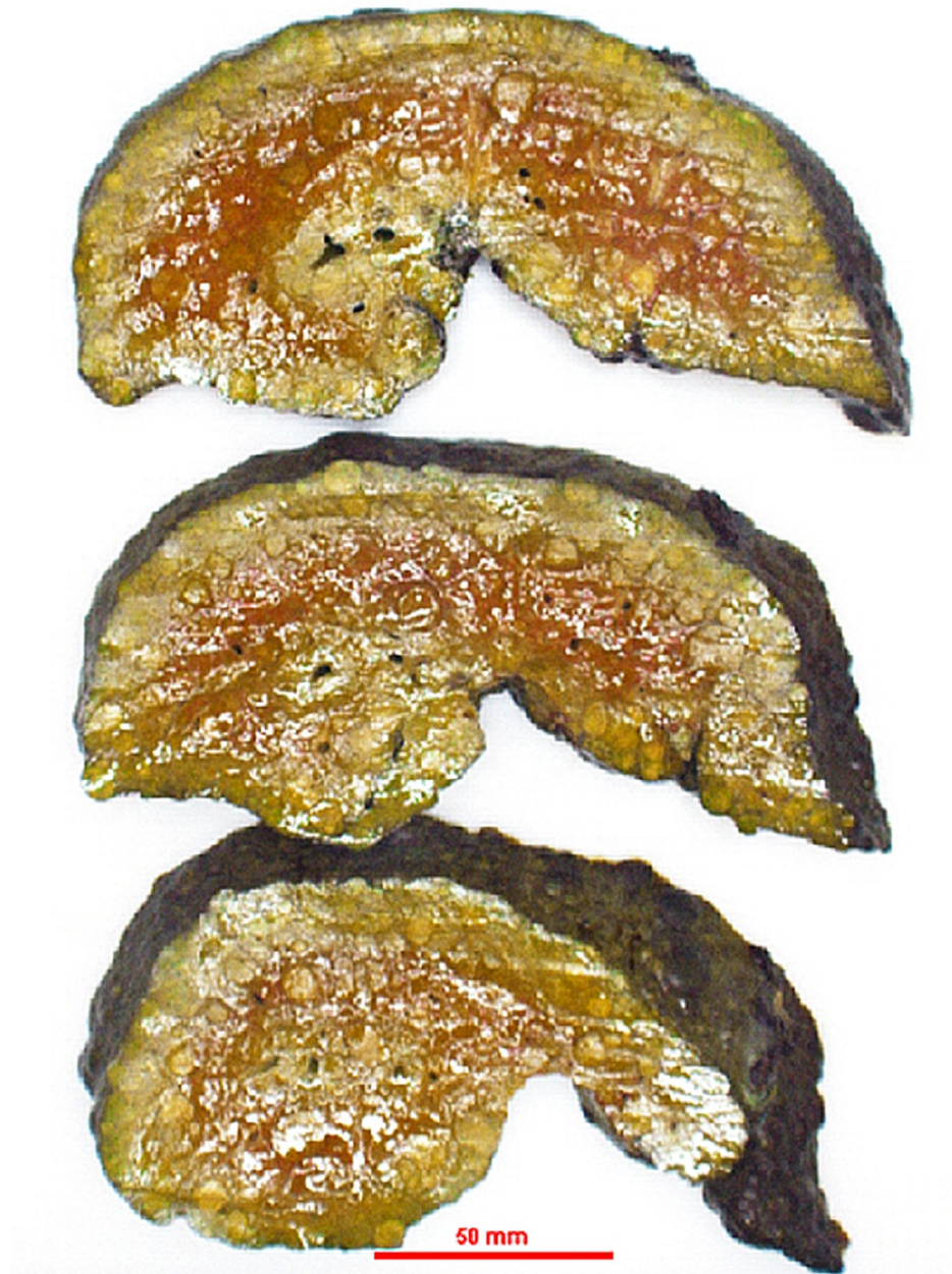
FIGURE 2: Gross examination of the explant liver with numerous yellow-green nodules on the cut surface

Histopathology revealed confluent necrosis and cholestasis with positive copper immunostain (Figure 3).