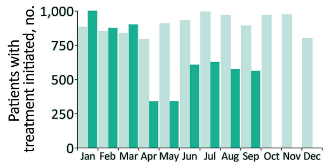
Figure 2. Hepatitis C virus treatment initiations, England, January 2019–September 2020. Data are from the National Health Service England Hepatitis C Patient Registry and Treatment Outcome system. Bars indicate the number of persons having treatment initiated by month for 2019 (light green) and 2020 (dark green).

We also observed a sharp decline in the number of persons tested for hepatitis during January–April 2020: by 63% (from 4,295 to 1,610) for HAV, 61% (from 57,392 to 22,224) for HBV, and 74% (from 43,238 to 11,250) for HCV (Appendix). The number of persons tested for HCV in community drug treatment facilities showed