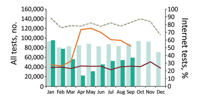
Figure 1. Total number of HIV tests provided through sexual health services (SHS) and proportion of those accessed through internet services, England, January 2019–September 2020. Bars compare HIV test data from SHS that reported complete data for January–September in both 2019 (light green) and 2020 (dark green). Dashed line represents the total number of HIV tests from all SHS reported in each month in 2019. Solid lines indicate the percentages of total tests accessed through the internet for 2019 (red) and 2020 (orange). Data are from routine specialist and nonspecialist SHS reporting to the GUMCAD STI Surveillance System.

heterosexual men (81% for HIV, 79% for STIs) and heterosexual or bisexual women (women who have sex with men or women; 76% for HIV, 75% for STIs) compared with gay, bisexual, and other men who have sex with men (MSM) (67% for HIV, 71% for STIs) and lesbian and other women who have sex exclusively with women (66% for HIV, 65% for STIs); recovery was slowest among heterosexual men. We observed the largest declines among persons of Asian (81% for HIV, 77% for STIs), Black (81% for HIV, 76% for STIs), and other (81% for HIV, 76% for STIs) races; persons of Black race showed the slowest recovery.