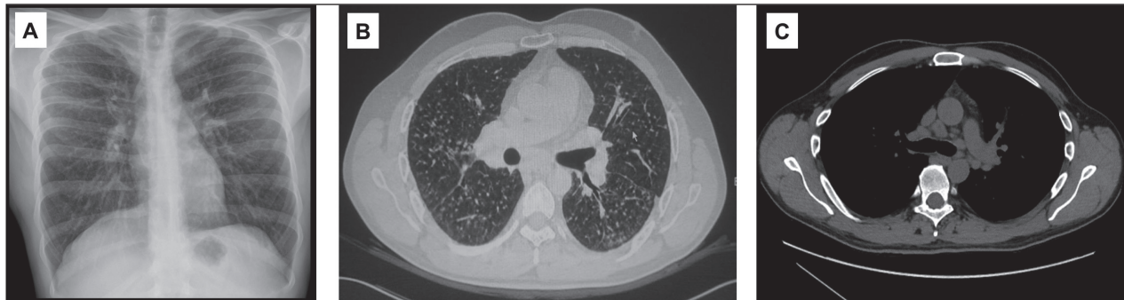
Figure 2 - Radiological findings of a worker with silicosis. A. Chest X-ray: diffuse bilateral interstitial micronodular pattern. ILO: p/q, profusion 2/2; B. Chest HRCT ICOERD: prevalent well-defined rounded grade 2 opacities, predominantly size p, profusion 14 and irregular/linear opacities, grade 2 and predominantly intralobular; C. Chest HRCT: multiple bilateral enlarged hilar lymph nodes

Figura 2 - Reperti radiologici di un lavoratore con silicosi. A. Radiografia del torace: interstiziopatia micronodulare bilaterale diffusa. ILO: p/q, profusione 2/2; B. HRCT torace ICOERD: opacità prevalentemente arrotondate ben definite di grado 2, prevalentemente dimensione p, profusione 14 e opacità irregolari/lineari, grado 2 e prevalentemente intralobulari; C. Torace HRCT: linfonodi ilari allargati bilaterali multipli