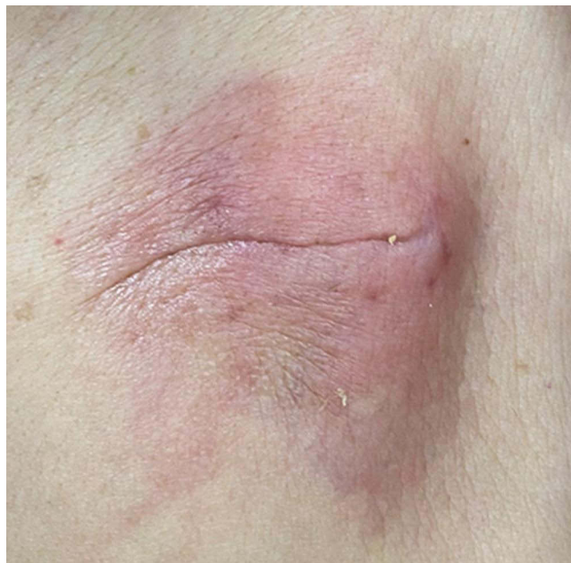
Figure 1 The patient's pacemaker pouch.