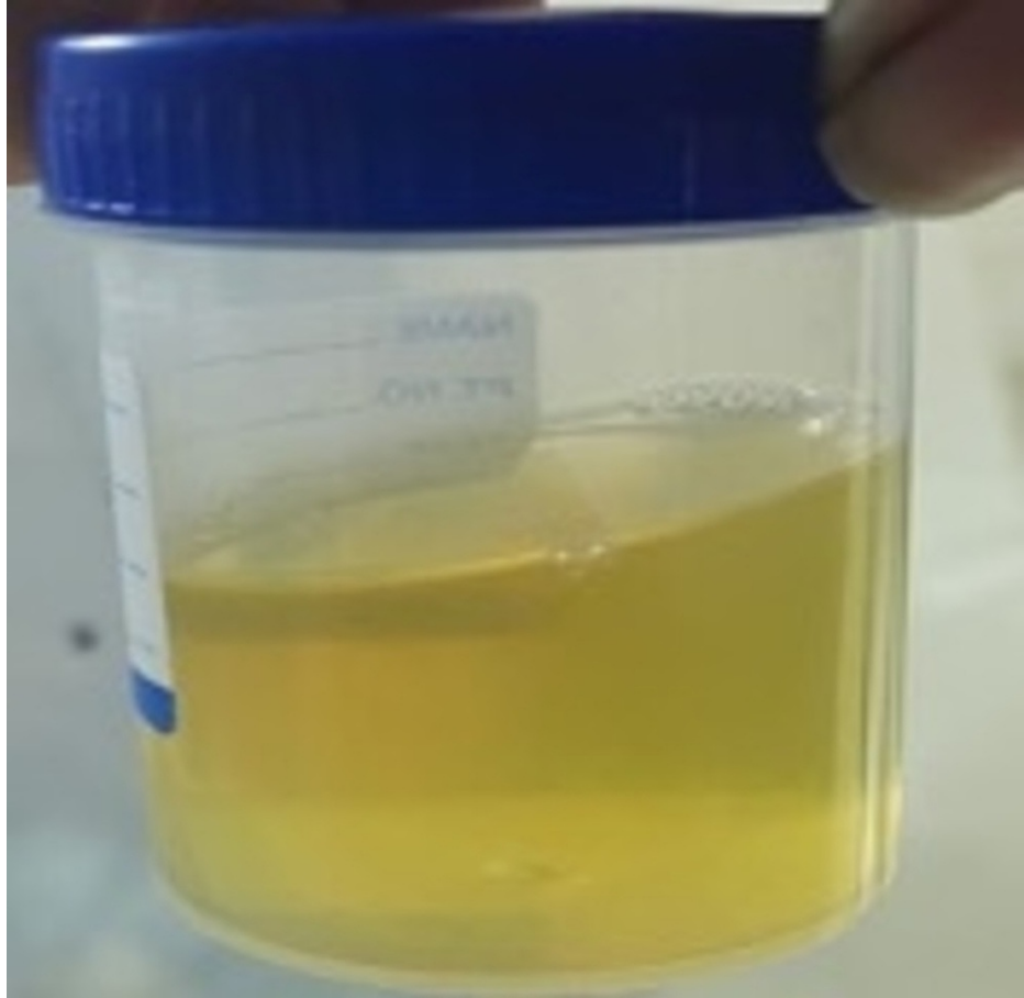
FIGURE 2: Urine on day 5 of sclerotherapy - Case 1

For further evaluation of chyluria, technetium-99m-sulfur colloid lymphoscintigraphy showed sluggish ascent of the tracer from the left inguinal nodes and cisterna chyli s/o left-sided thoracic duct obstruction. Diagnostic cystoscopy with retrograde pyelography revealed chyluria lateralizing to the left side, and retrograde pyelography showed the calyces (Figure 2).