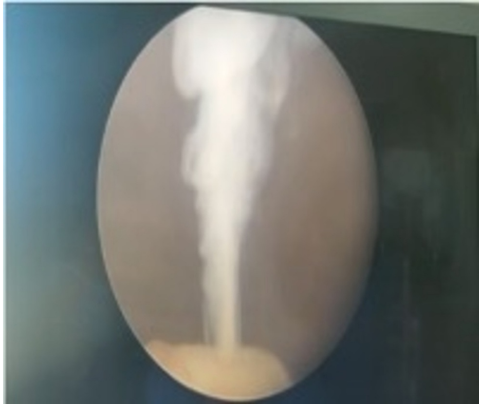
FIGURE 3: Cystoscopy demonstrating chyluria - Case 1

On routine follow-up after one month, urine was completely clear, with urine microscopy showing the absence of protein and red blood cells, and the 24-h urine protein was 40 mg/day, thus showing that the nephrotic-range proteinuria was chylous in origin. The patient was started with anti-HCV treatment after the resolution of chyluria and was followed up regularly for six months, with no recurrence of symptoms.