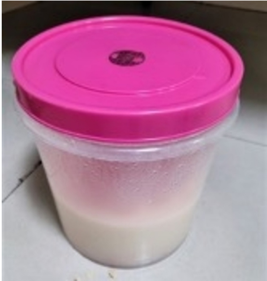
FIGURE 4: Milky urine - Case 2

On abdominal ultrasonography, the kidney size was normal (right kidney = 9.7 cm, left kidney = 9.8 cm) with no hydronephrosis, calculi, or renal mass. Cystoscopy revealed white efflux from both the ureteric orifices. Retrograde pyelography revealed mild chyluria from the right side and severe chyluria from the left side. The patient was started on daily instillation of 0.2% povidone-iodine solution in both pelvicalyceal systems through a ureteric catheter. A total of 10 doses were given. The patient had intermittent lower abdominal pain with dysuria, which was managed with analgesics. As her serum filarial antigen was positive, diethylcarbamazine 100 mg was given thrice daily for 12 days. Her chyluria and proteinuria were completely resolved on follow-up (Figure 5).