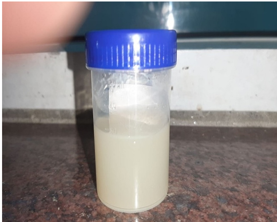
FIGURE 1: Milky urine (Case 1)