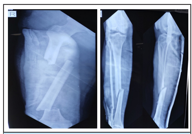
Figure 1. X-ray showing right femur fracture. Figure 2. X-ray showing right tibia and fibula fracture.

mild hypoxemia with hypocarbia, respiratory alkalosis and lactic acidosis. Transthoracic echocardiography showed moderate tricuspid regurgitation and peak gradient was 15 cm/s. Patient was diagnosed as fat embolism based on Schonfeld criteria. Petechial rash was also seen but altered sensorium was not seen in our patient. Bronchoalveolar lavage and demonstration of fat globules in urine and macrophages was not done as it was not available at our center.