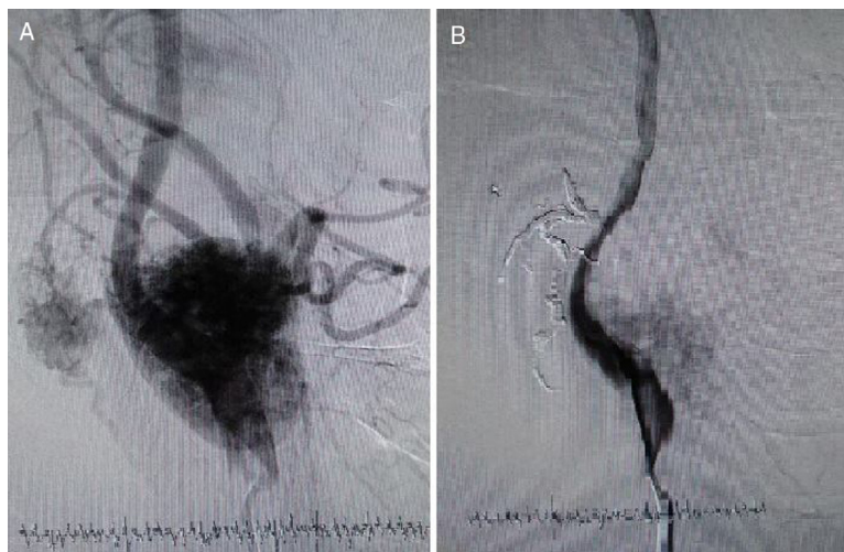
Figure 1 (A) Angiography before coil embolization. (B) Angiography after coil embolization.

The data were analyzed using SPSS 21. Descriptive statistics were performed. Numerical variables were expressed as mean \pm standard deviation, and categorical variables were analyzed as frequency and percentage. p < 0.05 was considered statistically significant.