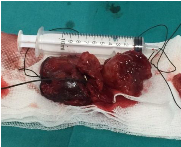
Figure 3 Macroscopic appearance of the tumor.