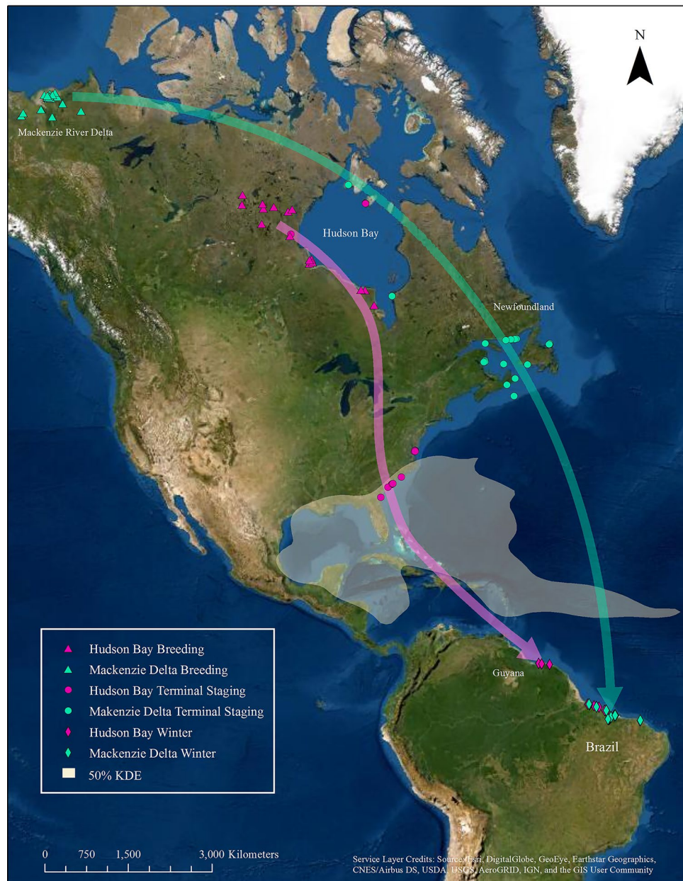
Figure 1. Stylized map of fall migration pathways for Mackenzie Delta and Hudson Bay populations and their overlap with the core area for tropical cyclone activity. Each triangle, circle, and diamond represent centroids for breeding territories, terminal staging locations, and wintering territories for each year and each individual. This figure was produced in ArcGIS 10.7.1 by an author: https://www.esri.com .

birds vulnerable to additional storm encounters. Five (71%) of the 7 birds that were not lost on islands were hit by storms while grounded.