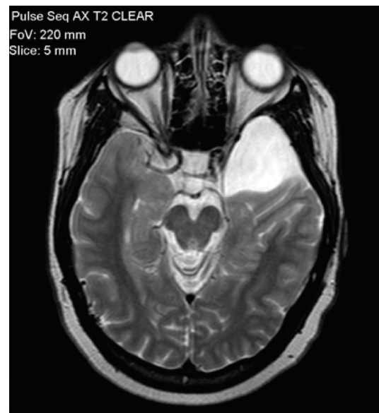
FIGURE 2: Cranial MRI without contrast in the horizontal plane, demonstrating the mass effect on the left temporal lobe by the arachnoid cyst.

arachnoid cysts. Aggressive behavior [4] and uncharacteristic violent behavior [12] have also been noted.