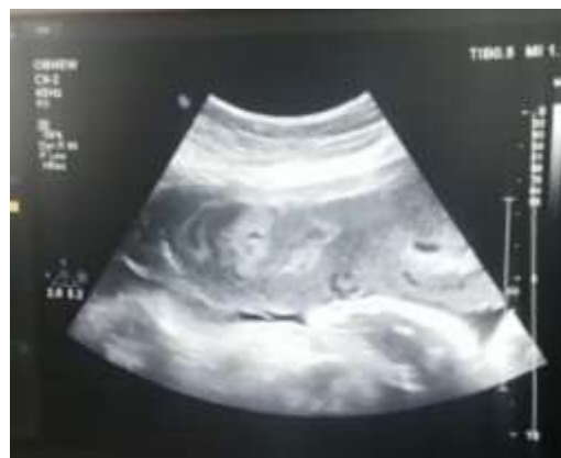
Figure 1: Ultrasound images of the placenta showing damage and fragmentation