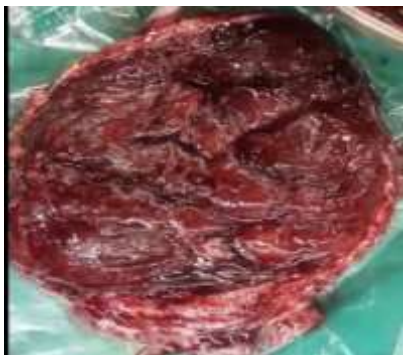
Figure 3: The image of the placenta has been extracted