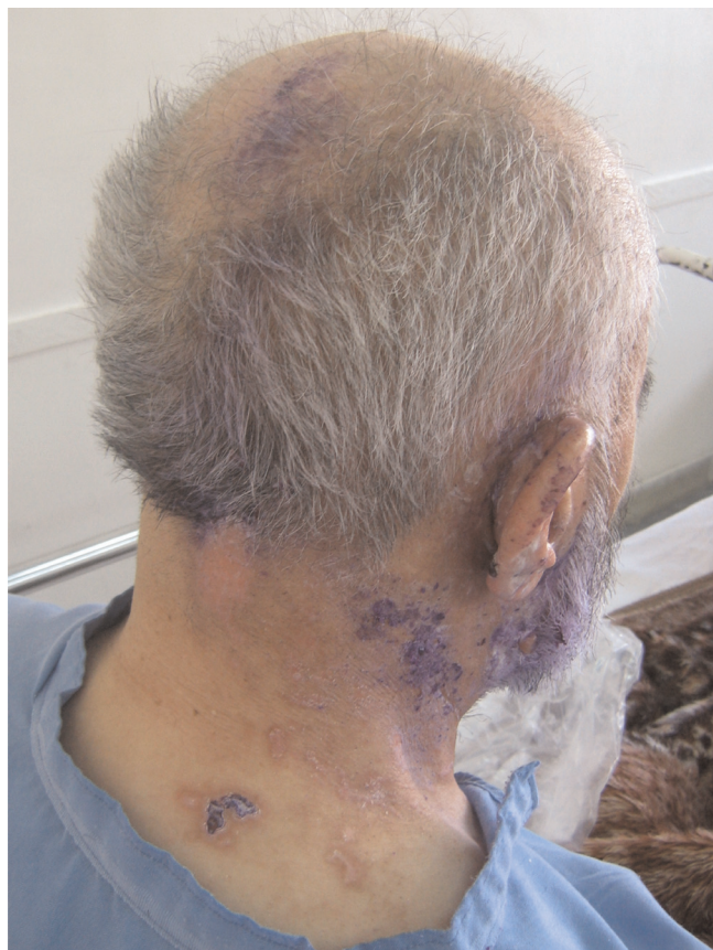
Figure 2. Herpetic vesicles along the distribution of the right facial nerve and throughout the C2 and C3 dermatomes.

involvement of other cranial or cervical nerves or ganglia [8]. In this report, we described an elderly with right-sided facial weakness along with vesicular eruptions on the right side of his neck and C2-C3 cervical dermatomes, indicating involvement of multiple sensory ganglia (geniculate ganglion and upper dorsal root ganglia) by VZV.