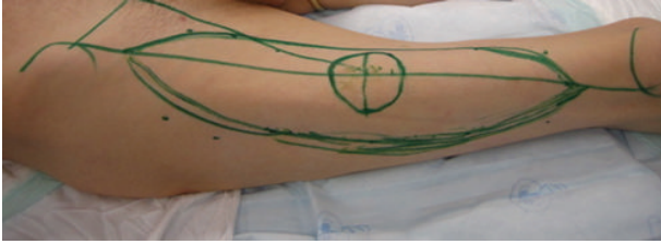
FIGURE 1: ALT flap design. Dimensions 12 cm × 40 cm.