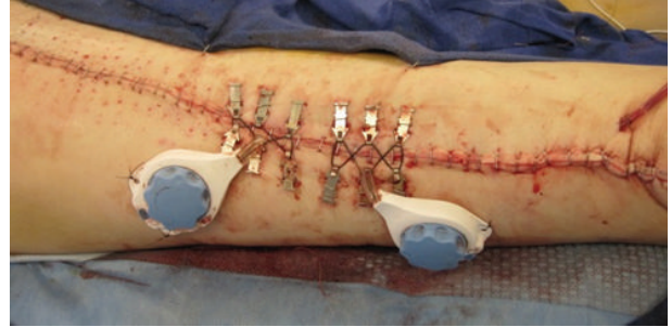
FIGURE 3: Primary closure obtained with utilization of two DermaClose systems.