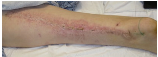
FIGURE 4: One month postoperative appearance.

The remainder of the defect was not suitable for primary closure utilizing this method. A continuous external tissue expansion system (DermaClose, Wound Care Technologies, Chanhassen, MN) was then applied in the shoelace technique with six anchors as described in the product insert at the cranial aspect of the remaining defect. Mechanical creep could be appreciated within minutes, which then allowed for primary closure in this portion of the wound. The expansion system was then removed and reapplied in a caudal direction and the process was repeated. Simultaneously, an additional external tissue expansion system was utilized in a caudal to cranial fashion until the wound was closed with the expanders meeting in the middle of the incision (Figures 2 and 3). The entirety of the wound was closed primarily at the initial procedure. A drain was left in place given the extensive undermining.