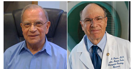
Insights from Adi F. Gazdar and John D. Minna.

human embryonic stem cells (hESCs) can be made to differentiate into pulmonary precursors (Huang et al., 2015). In a technical tour de force, they treated hESCs with the pulmonary differentiation regimen to generate “pulmonary precursor” cells and then systematically explored the effect of inhibiting the Notch pathway pharmacologically (Shih and Wang, 2007) and genetically inactivating RBI and TP53 . Their key findings are that Notch inhibition led to an increase in cells with a pulmonary NE phenotype and that this NE program cell expansion was facilitated by inhibiting RBI but not TP53 . However, by the combined effect of inhibiting Notch, RBI , and TP53 over several months, they had best expansion of pulmonary NE cells, and these expanded altered cells were capable of forming tumors in immunodeprived mice with characteristics of SCLC. By contrast, genetically altering these same precursor cells with mutant KRAS or mutant EGFR (alterations that are found in lung adenocarcinomas) did not lead to the expansion of pulmonary NE cells or SCLC development. This work thus provides entirely new