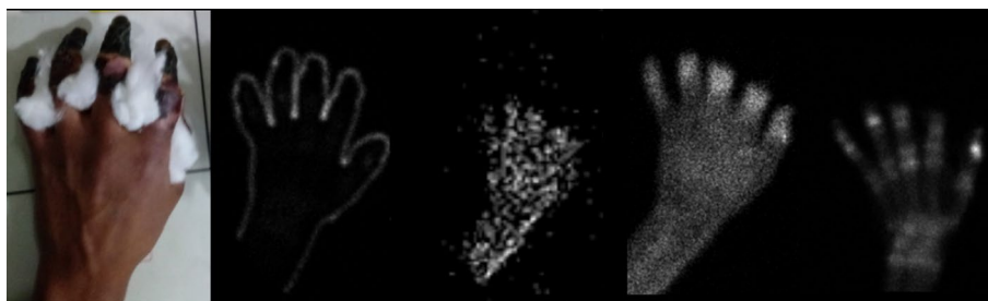
Fig. 4 High clinical-imaging correlation showed for the right hand. Clinical appearance of a fourth-grade frostbite injury. Peripheral marking of the hand with ^{99m}\text{Tc} -MDP to delimit the contour. Multiphase ^{99m}\text{Tc} -MDP bone scintigraphic images. Note the increased tracer uptake between the phalangeal joints related to the level of necrosis on the delayed phase image

crystals and preserve cells. Notwithstanding, these products impoverish the cell environment and produce detrimental effects, such as hypoxia and microthrombosis, creating a vicious circle where the production of more substances is stimulated, resulting in cell death (Manganaro et al. 2019; Murphy et al. 2000).