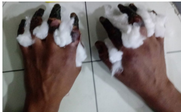
Fig. 1 Physical examination demonstrated gangrene involving all digits of both hands, concluding a fourth-degree frostbite. Therefore, multiphase ^{99m}\text{Tc} -MDP bone scintigraphic imaging was performed to both hands