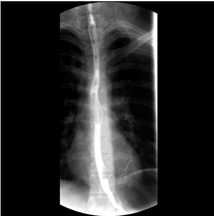
Figure 3. Normal esophagography.

The most frequently observed symptoms in esophageal perforation are dysphagia, odynophagia, chest pain, and shortness of breath. No specific physical symptoms are associated with the early period. The most commonly observed finding is subcutaneous emphysema. 4 In the current patient, the single finding present was back pain in the left paravertebral area. The absence of any skin lesion, deformity, or crepitation that might have accounted for pain in that region led to suspicion of esophageal perforation. When possible causes of the minimal pneumothorax, pneumopericardium, and pneumomediastinum observed on thoracic CT were investigated, the sternum and scapula were healthy, while stable bone fractures were present in the transverse processes in the clavicle and vertebra. No pulmonary contusion or bronchopulmonary lesion was seen. All of these negative findings caused suspicion, and the patient was evaluated for esophageal perforation in the early period. Esophageal perforation might have been easily overlooked had even one of these injuries been present in the patient.