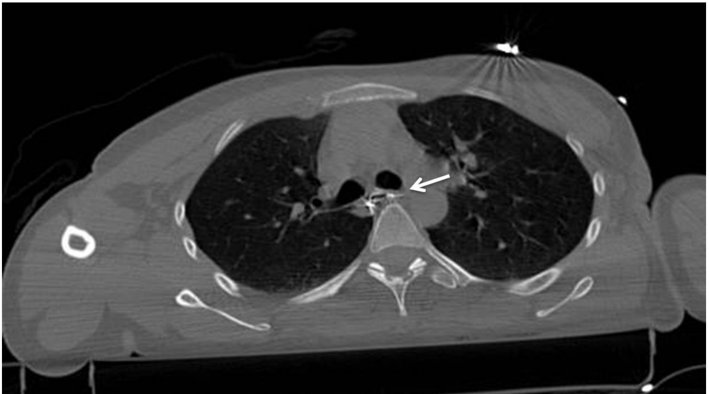
Figure 2. Thoracic computed tomography with oral contrast enhancement showing extraluminal contrast material from the esophagus.

Esophageal perforation is one of the most frequent causes of thoracic trauma-related mediastinitis. Iatrogenic causes are the most common in the etiology. 3,4 The mechanism involved in blunt trauma-related esophageal rupture is unclear. The most common theory is that, as in Boerhaave syndrome, perforation occurs in the weakest area of the esophagus. 5 Perforation can also occur when the esophagus is trapped between the sternum and thoracic vertebrae in association with fracture or compression of the thoracic vertebrae. 6 Only a T1 transverse process fracture was present in the current case, and the region of the esophagus with contrast leakage was inferior to the carina. Therefore, the probable mechanism was thought to involve a rise in intraluminal pressure.