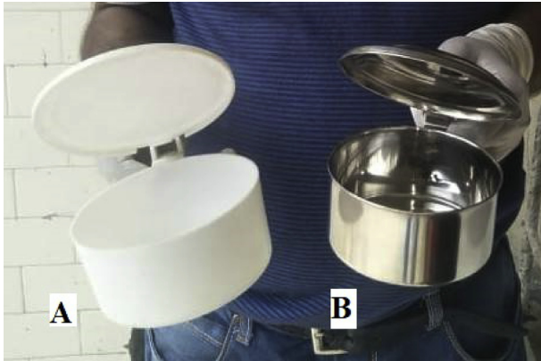
Figure 1. The cups used in the study. (A) Microwavable plastic cups, (B) Steel cups.

being expectorated in sputum could not be ignored. After this, the sputum was poured from each steel cup into a separate microwavable plastic cup and microwaved in the OptiMazer™ 30 machine according to the manufacturer's guidelines (Figure 1); steel and plastic cups were later sterilized by autoclaving and used again. The machine first sprinkled water over these loosely closed plastic cups and then operated at 2450 MHz, 1.5 KW to heat the entire load to 100°C. Holding temperature and time for sterilisation were set at 100°C for 30 minutes. The steps followed were according to the manufacturer's guidelines for routine BMW. Free falling loose lids over these plastic cups ensured proper steam and radiation effect. Spores of Bacillus atropheus (HiMedia Laboratories Pvt. Ltd.) were used as controls and kept alongside the sputum filled cups in the centre of the machine. Now, a small portion of this microwaved sputum was processed by NALC/NaOH [16] method; stained by ZN stain and cultured by MGIT to appreciate radiation-induced changes in the structure and viability of M. tuberculosis bacilli. Approximately 350–400 plastic cups were microwaved each day in 4–5 batches. Control ampoules were checked for any colour change.