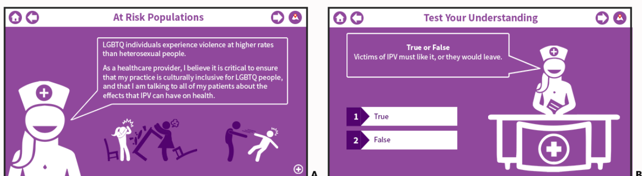
Figure 2. Exemplar screenshots of a (A) health care provider slide and (B) interactive quiz question.

My favorite thing is the doctor/nurse speaking to you at various junctions of the program. This strengthens the messages. [NS15]