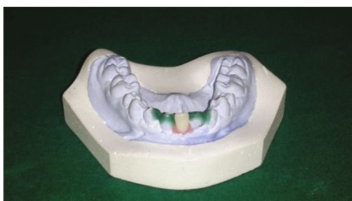
FIGURE 6: Lower arch "Kesling diagnostic setup."