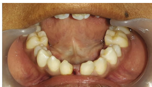
FIGURE 8: Intraoral photograph showing immediately after extraction of 81.

facilitate the eruption of 25, recontouring of upper and lower incisors with composites after completing orthodontic treatment, and replacement of missing 31 and 41 spaces with one tooth with a cantilevered resin-bonded bridge (RBB) from 32.