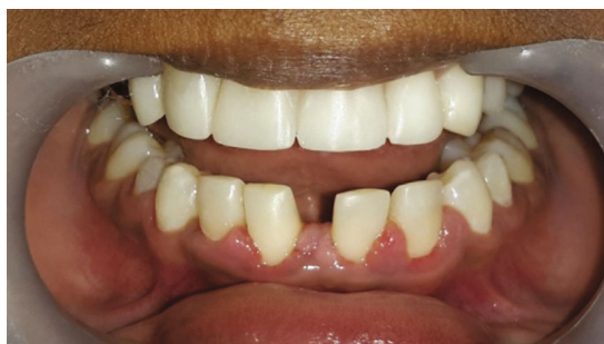
FIGURE 11: All conical incisors were recontoured with LCC.