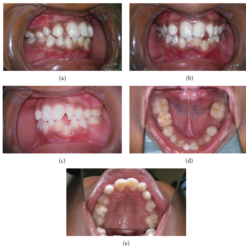
FIGURE 3: Preoperative intraoral images of (a) right buccal, (b) closed mouth, (c) left buccal, (d) lower arch, and (e) upper arch views.