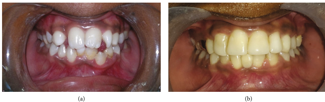
FIGURE 13: Comparison of preoperative and postoperative aesthetic outcomes.

are the presence of posterior natural teeth, facial aesthetics, lip support, number and size of existing natural teeth, and the occlusal vertical dimension.