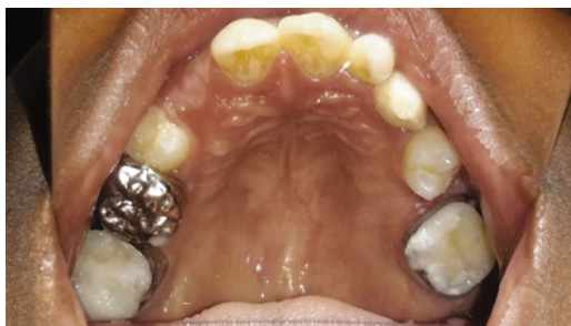
FIGURE 5: Intraoral photograph shows cemented crown and molar bands.