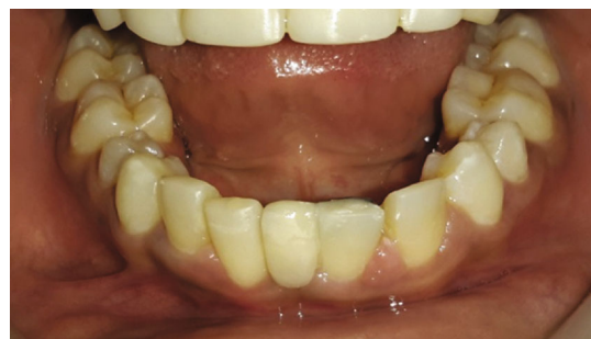
FIGURE 12: RBB was cemented to replace missing lower central incisors.

The main demand of these patients is replacing their missing teeth and recontouring of the malformed teeth to improve their aesthetics and functions. But the conventional prosthodontic treatments are considered problematic in severe hypodontic cases [18] that may be associated with underdeveloped alveolar ridges in edentulous areas and malformed or overretained deciduous abutment teeth which will lead to poor support, stability, and retention of the prosthesis.