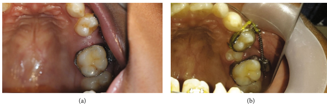
FIGURE 9: Intraoral photographs of 25 (a) before and (b) after surgical exposure.