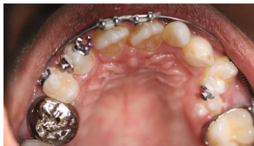
FIGURE 7: Intraoral photograph showing cemented palatal button on rotated 13 and 24.