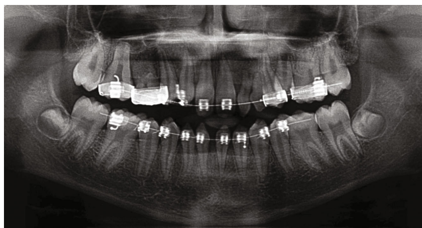
FIGURE 10: The “near-end radiograph” (digital dental panoramic tomograph).