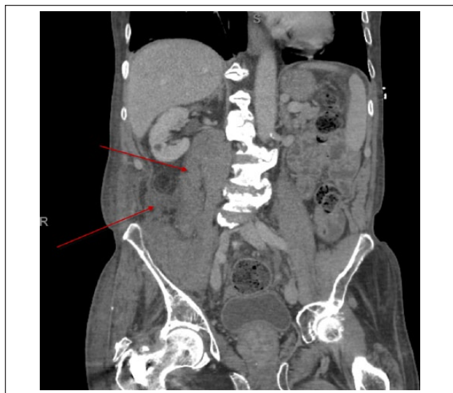
Figure 1. Top arrow, abnormal right iliopsoas–intramuscular hemorrhage; Lower arrow, hemorrhage in the retroperitoneum; contralateral, normal left iliopsoas.

Computed tomography of the abdomen and pelvis was obtained, which showed extensive intramuscular hemorrhage within the right iliopsoas musculature, extending from the level of the right renal pelvis into the right inguinal region, as well as a small amount of hemorrhage in the adjacent retroperitoneum (Figure 1). Computed tomography did not reveal any active bleeding however. The patient was admitted to the hospital for further care and stabilization. There was no evidence of femoral nerve compression and surgical intervention was not indicated. Furthermore, serial complete blood counts were obtained and his hemoglobin remained stable. Therefore, he was not transfused with any blood products. He was eventually discharged and ibrutinib was discontinued on diagnosis of iliopsoas hemorrhage. One-month follow-up showed stable hemoglobin, and the patient remains off ibrutinib due to ongoing concern about spontaneous hemorrhage.