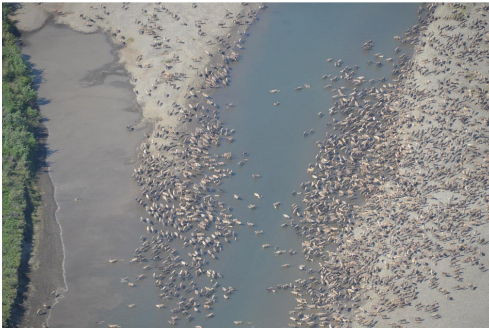
Figure 2. Caribou aggregating on gravel bars and in the river itself in an attempt to reduce insect harassment, northwest Alaska. Time spent in insect relief habitat reduces the amount of time spent foraging.