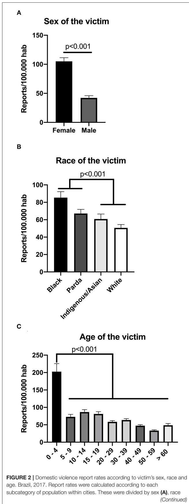
FIGURE 2 | (B) or age (C) of the victim. Data in (A) analyzed through paired non-parametric Wilcoxon test, whereas data in (B) and (C) were analyzed through non-parametric Friedman test with Dunn's multiple comparison test, since data did not pass normality test. P -values shown in figure. Bar graphs express mean ± S.E.M for 259 observations.

were higher rates for women, black individuals and children under four, highlighting subgroups of the population that were more vulnerable. Indeed, these groups were correlated differently with socioeconomic variables. Poverty, assessed as Bolsa Família investment, was negatively correlated with domestic violence report rates across vulnerable groups, that is, poorer cities tended to present higher rates of domestic violence notifications. Thus, we show that black women and children are more vulnerable to domestic violence and suggest that improving household size, reducing poverty and structural racism would be an effective way to reduce cases of domestic violence.