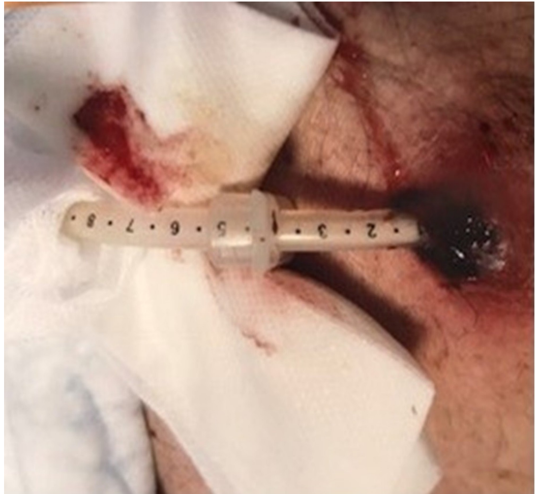
FIGURE 1: The patient's abdomen with a gastrostomy tube

was no guarding or rigidity. A gastrostomy tube was seen, and the scale indicated that the internal bumper had dislodged (Figure 1). Dried blood was seen at and around the gastrostomy site. On rectal exam, melena was discovered.