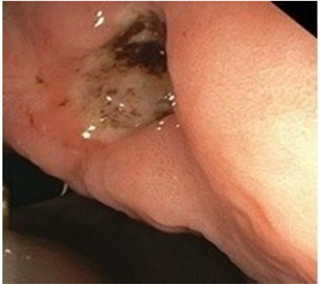
FIGURE 2: Endoscopic image of an ulcer in the gastric wall at the gastrostomy site

stomach was confirmed by endoscopy. The internal balloon was inflated with 15 mL of water.