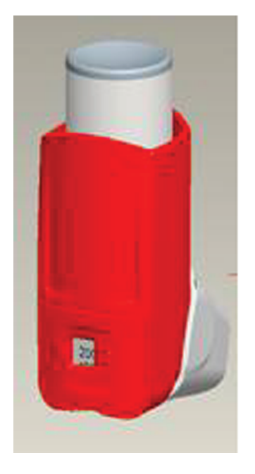
FIGURE 2.— Integrated dose counter on a metered-dose inhaler. Shown here is a ProAir<sup>®</sup> metered-dose inhaler (manufactured by Teva Pharmaceutical Industries, Ltd., Horsham, PA).

economic burden of asthma management is already considerable. In 2009, the estimated annual expenditure related to health care and lost productivity due to asthma was more than $20 billion according to the National Heart, Lung, and Blood Institute (28). Nevertheless, dose counters may reduce health care costs by decreasing asthmarelated morbidity and attendant medical costs (14,17). For example, inhalation of rescue medication rather than propellant to control acute bronchospasm and quell acute asthma symptoms may avoid the cost of an emergency room visit (29).