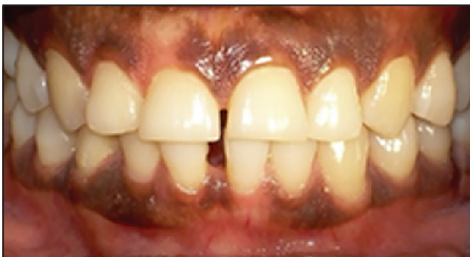
Figure 8. Clinical view at 3.5 years showing stability of the aesthetics and the hard and soft tissues

marked manner to an appropriate sensitivity test (thermal and electrical), there is a clear sign of pulp vitality. If there is no or minimal reaction, the result initially has no informative value. A complete rupture of the pulp is possible, which would result in necrosis of the pulp of a tooth for which growth has ceased. Yet, an apical irritation can lead to a temporary loss of sensitivity, which is generally not linked with a loss of vitality (5). At the first consultation, any tooth exhibiting a root fracture without contacting the oral cavity should be treated as a live tooth without considering the sensitivity test (8).