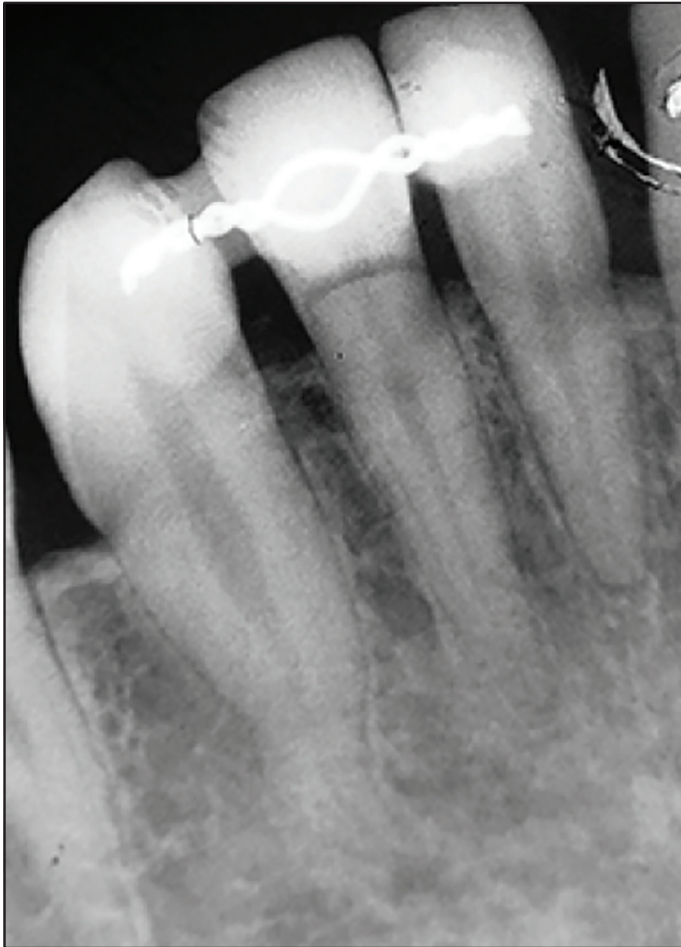
Figure 7. Radiographic control at three years showing probable consolidation process on the 1/3 coronal

The tests for pulp vitality were positive from the time of the clinical examination until the last check-up performed at 3 years of follow-up. If the tooth reacts immediately and in a