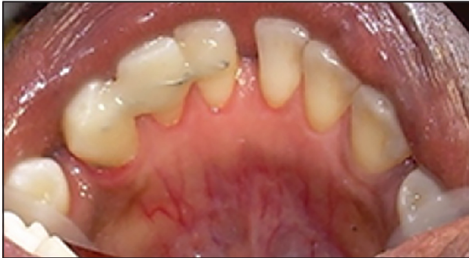
Figure 3. Clinical lingual view of the oral cavity after installing the splinting system from tooth 41 to tooth 43

sors, which are involved in >85% of trauma cases, due to their extremely forward position that renders them a 'bumper'; then, in decreasing order, there are the upper lateral incisors and the central lower incisors (1). In the present case, the patient exhibited misalignment of the lower incisor-canine set. The degree of movement depends on the severity of the trauma and the location of the fracture line. The movement can be considerable when the fracture is located in the coronal one-third. If the fracture line is located in the apical one-third,