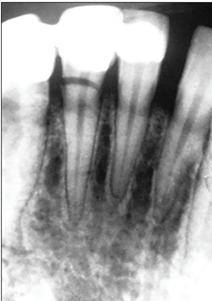
Figure 4. Radiographic X-ray control after splinting