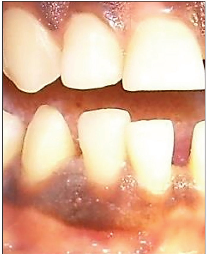
Figure 1. Clinical view showing the intactness of the dental-periodontal tissues

No medication was prescribed in light of the lack of functional signs. The patient was advised in regard to oral hygiene and eating, and a follow-up schedule was implemented. A check-up was carried out on day 15 and then every month up to the sixth month, followed by yearly check-ups. In these check-ups, the edge of the gum, discoloration of the tooth and the pulp vitality were evaluated. X-rays were taken at regular intervals from 1-6 months and then annually over a 3-year period to note whether consolidation, resorption, or canal obliteration occurred. Considering the position of the extra-alveolar fracture line, the semi-rigid immobilisation was permanently retained in place. The outcomes at the sixth month revealed that pulp vitality was still preserved, consolidation of the apical fracture had occurred, but coronal root fracture showed no signs of calcification (Figure 5).