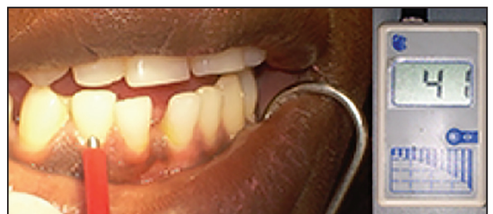
Figure 6. Positive electrical test of pulp vitality (PT O2 Dental Pulp Tester, Aeron) for tooth 42