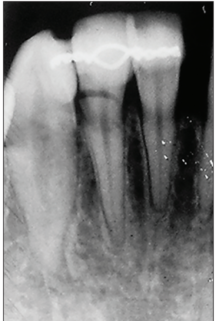
Figure 5. Radiographic X-ray at 6 months showing consolidation of the apical one-third fracture and absence of consolidation of the coronal one-third one