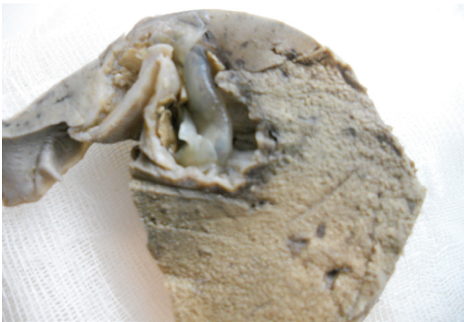
FIG. 1. Hydatid cyst in the liver.

The case was a 15-year-old boy, without any known prior illness. He was admitted to the hospital after feeling unwell and dropping to the ground while playing ball, and subsequently died. During the internal autopsy examination in our institution, a cystic structure, with dimensions of 13x6 cm, was observed in the left lobe of the liver. Hydatid cyst was not found in other organs of the body. In a macroscopic examination of the liver, a smooth-bordered cystic structure, with dimensions of 13x5x4.2 cm, was observed (Figure 1). On the sectional surface, a white membranous structure and haemorrhagic fluid were observed. The histomorphological examination of liver sections obtained from the cystic area revealed findings consistent with a hydatid cyst invading the external wall, the cuticular layer, and the germinal layer (Figure 2). In addition, the histomorphological examination of liver sections showed a fresh haemorrhage in areas near the cystic wall and scolices in the hepatic lumina (Figure 2), and the histomorphological examination of pulmonary sections showed scolices observed in pulmonary vessel lumina, thus a non-thrombosis hydatid embolism was diagnosed (Figure 3). No toxic agent was identified in a toxicological analysis. Based on the findings, the cause of death was recorded as a non-thrombotic hydatid embolism.